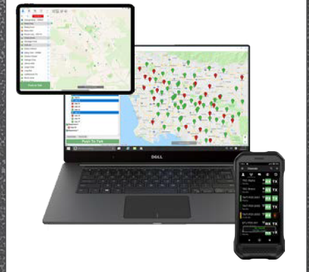
MyFSConnect application available for Android and iOS smart devices.