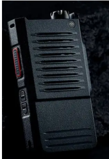
Portable Wearable is a compact, ruggedized, device for heads up communication.