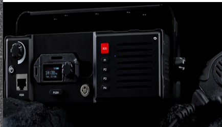
MyFSConnect Mobile 2 provides a choice of vehicle installation and user interface options.