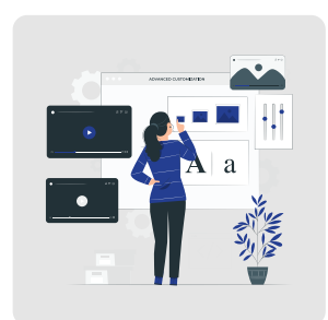
Simulate & Educate