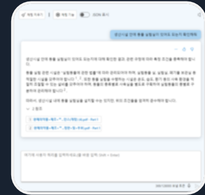
[Prototyping Output Example - Chatbot]