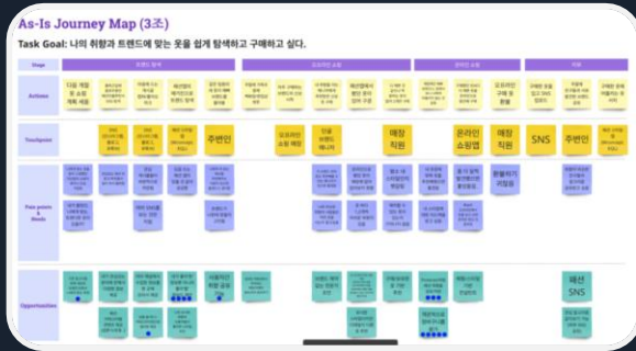
[Customer Journey Map]