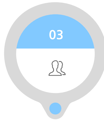
Gen AI Expertise

Only GSI Partner with Opsera – Up to 25X faster Migration, 100s of Dashboards