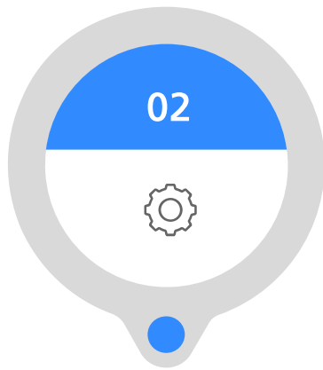
Solo Opsera Partner

LTIMindtree & GitHub Strategic Partnership for the First Mover Advantage