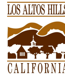
Los Altos Hills, CA