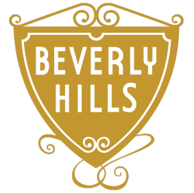
Beverly Hill, CA