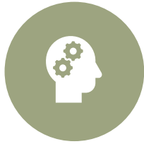
AZURE COGNITIVE SERVICES FORM RECOGNIZER