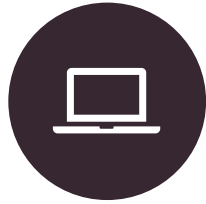
.NET CORE (C#)