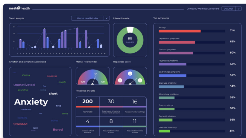
Company mental health dashboard - admin view