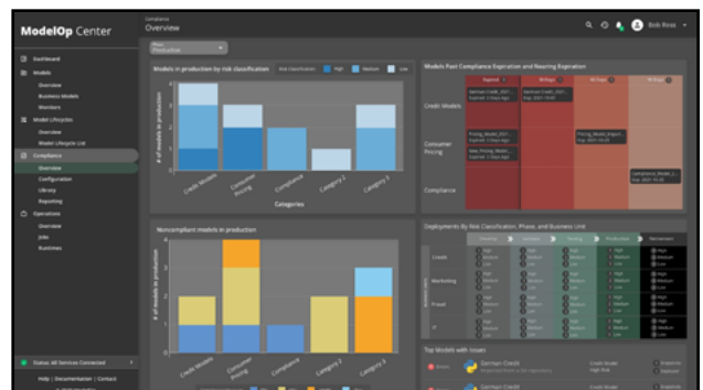
ModelOp Center's Business, Operational, and Risk Visibility for All AI Models

Complete Enterprise Model Visibility and Auditability With a 360 view of all production models, you have continuous oversight to ensure expected business value, operational efficiency, and risk and compliance mandates are met. Custom views and reports make it easy for stakeholder-specific insights and audit requirements to be satisfied.