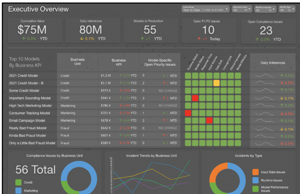
ModelOp Center Dashboard

Complete Enterprise Model Visibility and Auditability With a 360 view of all production models, you have continuous oversight to ensure expected business value, operational efficiency, and risk and compliance mandates are met. Custom views and reports make it easy for stakeholder-specific insights and audit requirements to be satisfied.