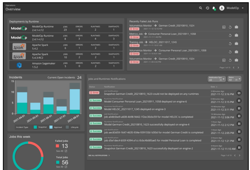
Comprehensive set of out-of-the-box tests

ModelOp, the pioneer of ModelOps software, enables enterprises to address the critical governance and scale challenges necessary to fully unlock the transformational value of enterprise AI and Machine Learning investments. Core to any AI orchestration platform, G2000 companies use ModelOp products to govern, monitor and orchestrate models across the enterprise and deliver reliable, compliant and scalable AI initiatives.