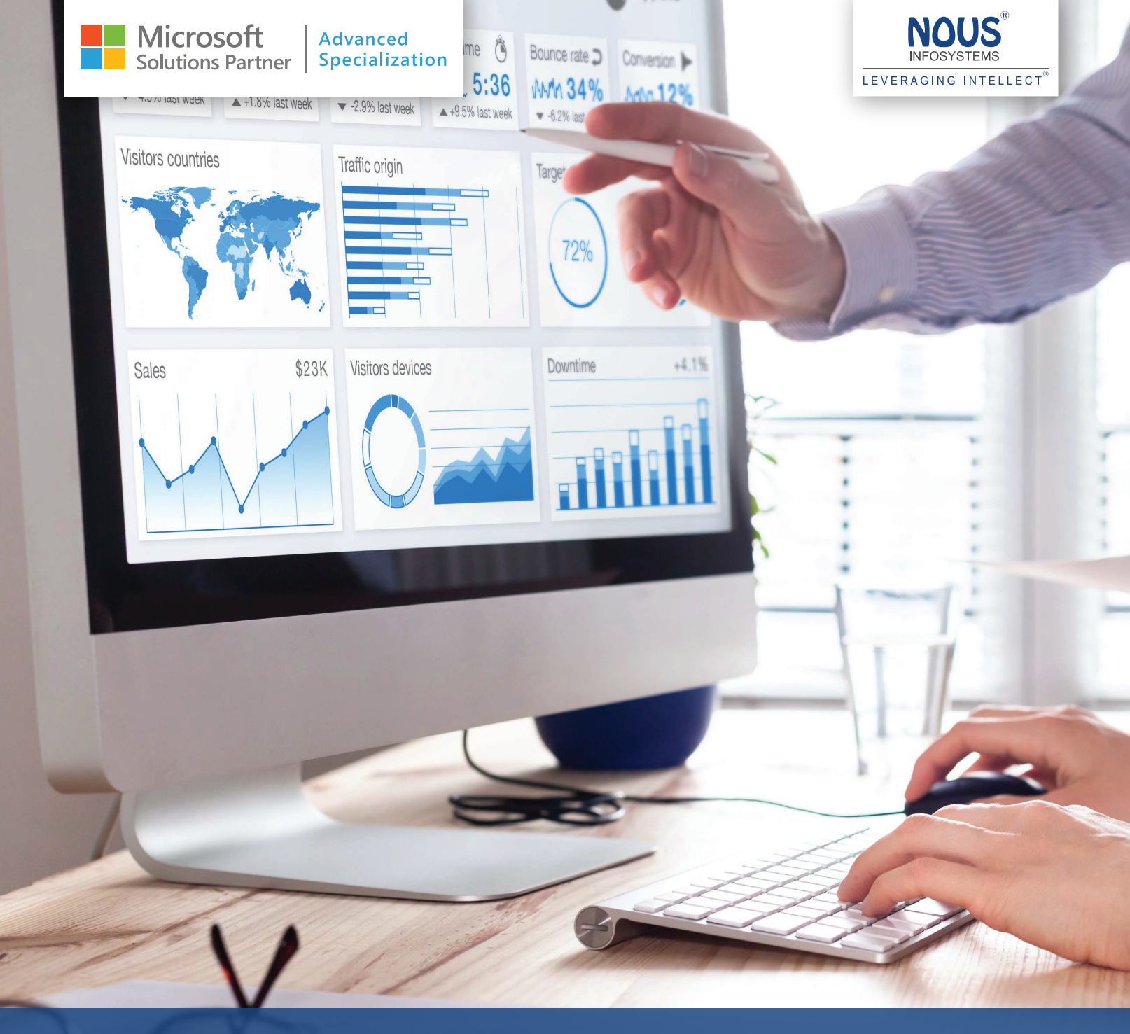
TABLEAU TO POWER BI MIGRATION

Nous Tableau to Power BI migration methodology includes feature mapping checklists, best practices templates and leverages NousMigrator™. The NousMigrator™ tool automates the migration of data extracts from Tableau to Power BI, accelerating the migration process and reducing overall migration costs.