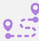
Definition of a Roadmap