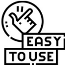
Easy & accessible security solution