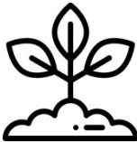
Mature cyber threat intelligence