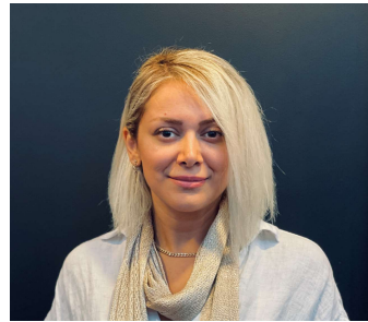
Sola Marketing Director

He is an experienced cybersecurity expert with extensive experience in helping organisations overcome their cybersecurity challenges.