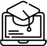
Gamified cyber awareness & education