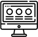
Single pane of glass