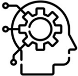
AI/ML powered scoring engine