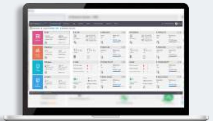
BUSINESS FUNCTIONS & INFRA OBJECTS VIEW