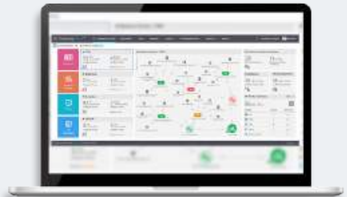
BUSINESS SERVICES VIEW