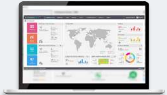
UNIFIED CXO DASHBOARD