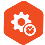
Service Ticket and Tracking