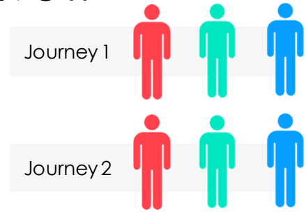
Cross Functional Team