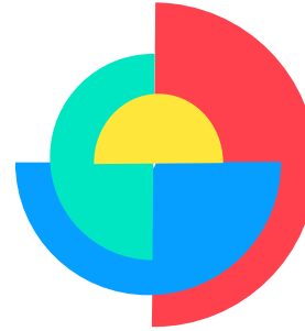
PS How Value Delivery Methodology