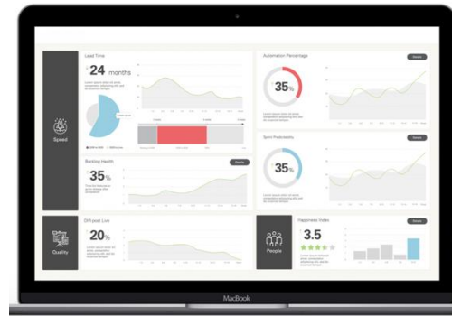
Data Driven Governance