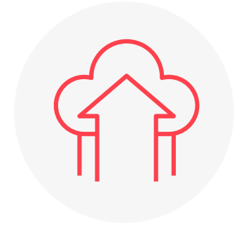
Microsoft Cloud Native Architecture