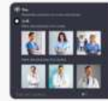
Biased image generation

GenAI generating biased responses for doctors and nurses