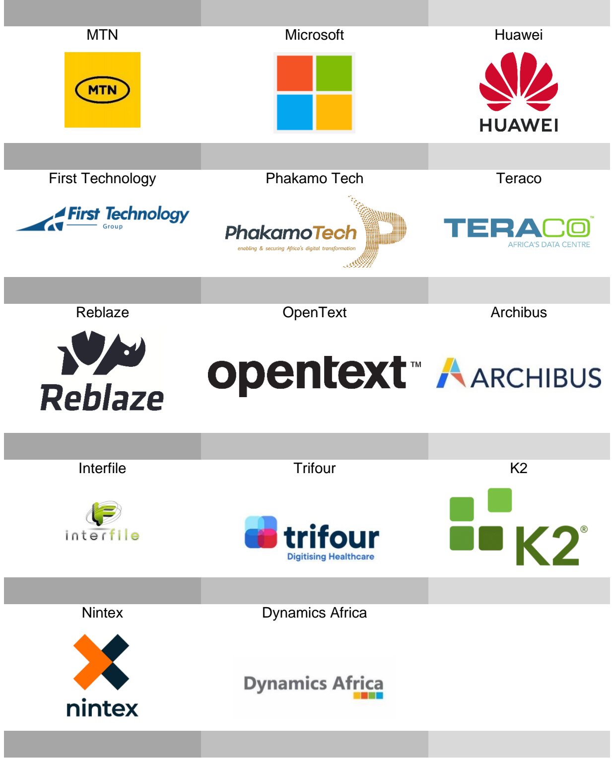
Table 2: Company Profile: Our Business Partners