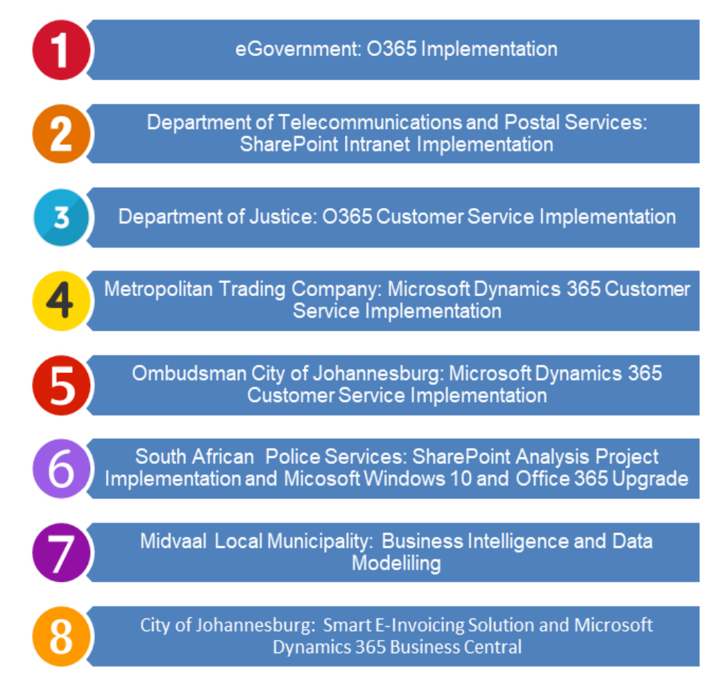
Figure 2: Company Profile: Our Footprint

Below are projects that Rifumo have been involved in, that illustrate our capability and experience in delivering Microsoft solutions.