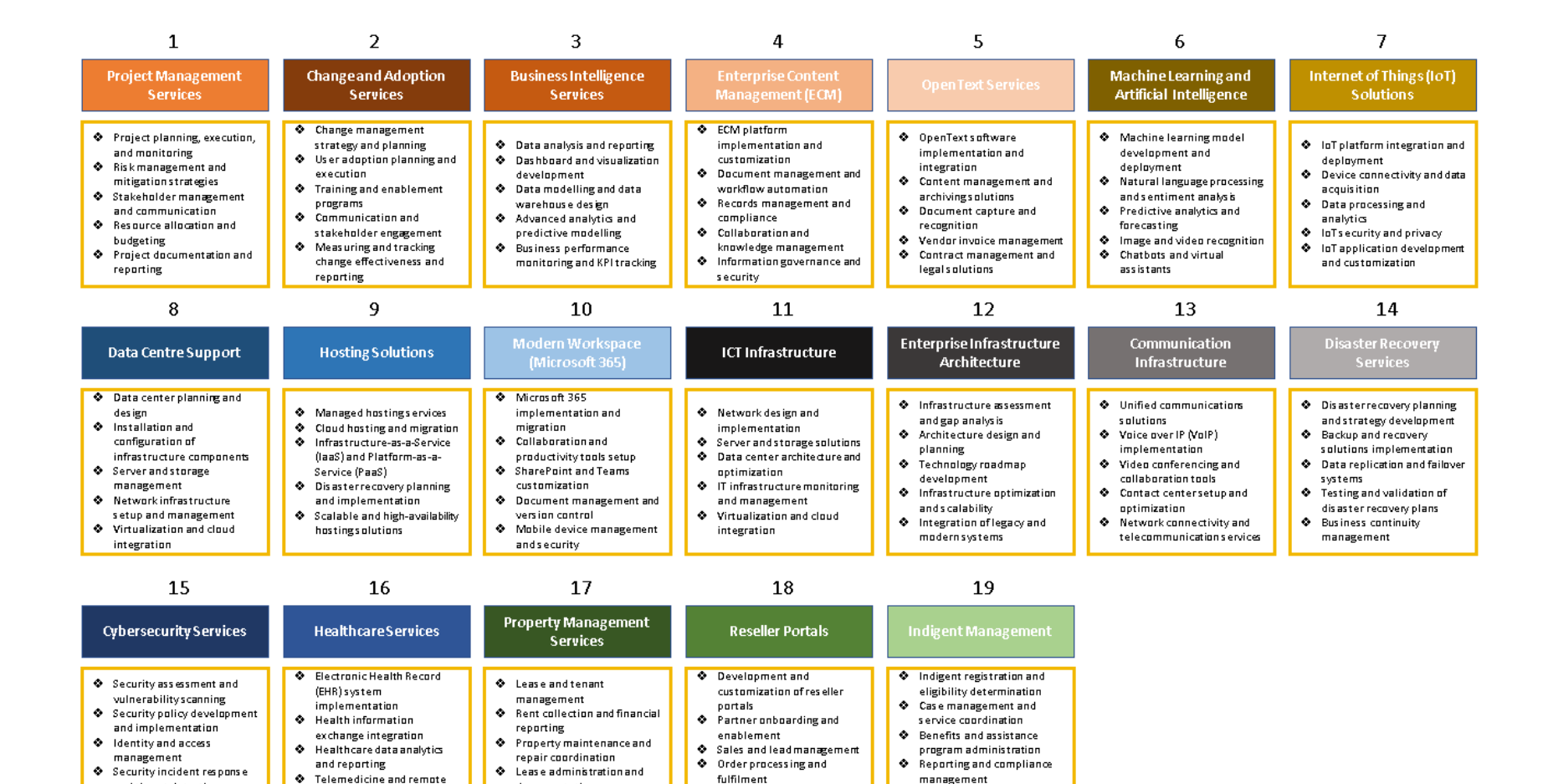
Figure 1: Company Profile: Consulting Services