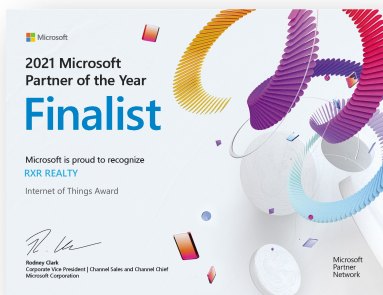
2021 Microsoft Partner of the Year Finalist in IoT