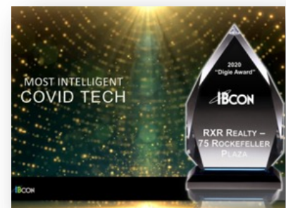
2020 Realcomm Digie Award Winner