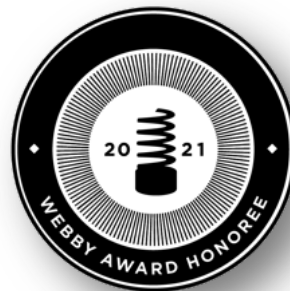
2021 Webby Award Honoree