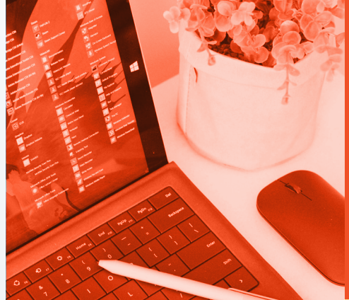
Freedom of license management Manage the available options and adapt them to your current needs