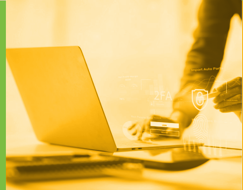
Secure your business Help secure business data with built-in security features.