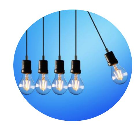
"Matching organization & tool knowledge for successful operations"