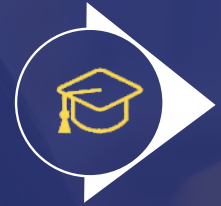
LMS (Moodle, Blackboard etc.)