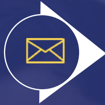
SMS & Email