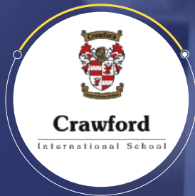
CRAWFORD SCHOOL, KENYA