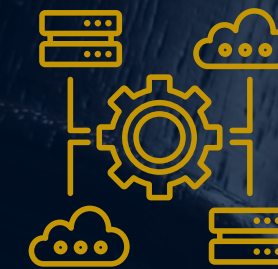
INTEGRATION WITH O365 SUITE