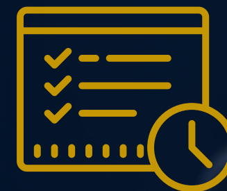
CALENDAR & TIMESHEET MANAGEMENT