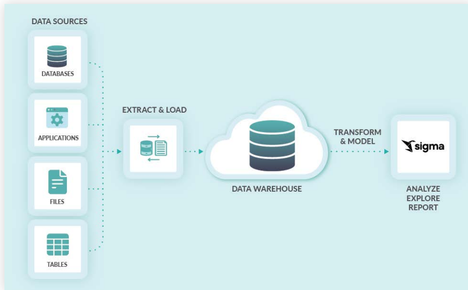
Explore, analyze, and report on massive live datasets and leverage your Data Warehouse's data governance within Sigma