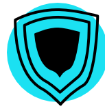
Efficiency in Security Operations