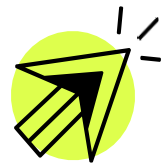
Improved Organizational Compliance