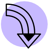
Reduction in Data Breach Costs

You can begin your Zero Trust journey immediately, regardless of your current stage. Slalom offers a Zero-Trust assessment package to provide a snapshot of your current security posture. Based on this assessment, we can create a customized roadmap to help you achieve your security goals and prioritize actions effectively.