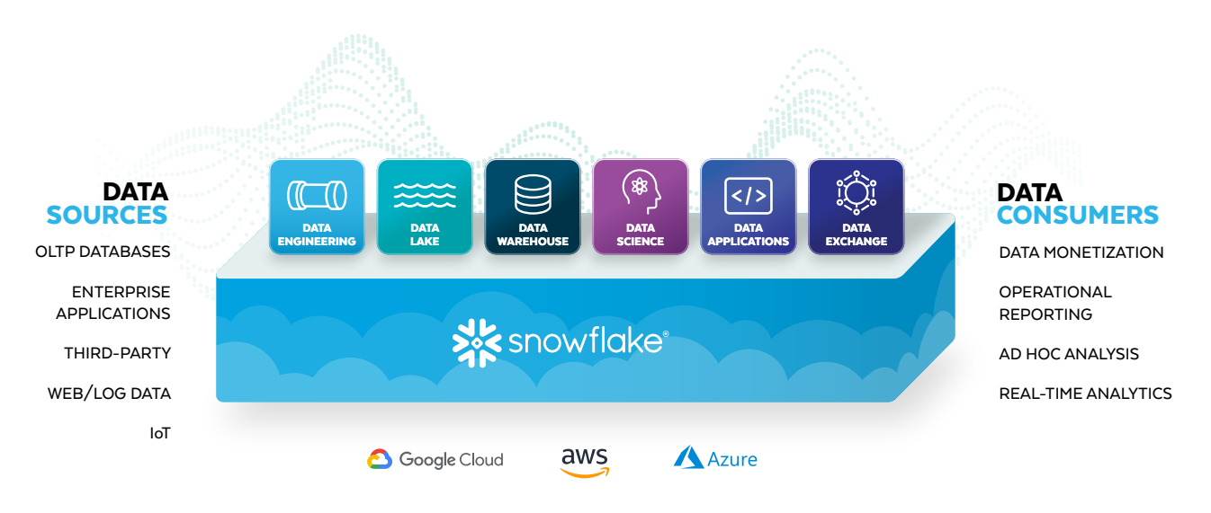
Figure 4: Snowflake powers and extends your data architecture, so you can easily get all your data into a single location and get all the insights from that data.