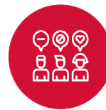
Poor organizational alignment & accountability