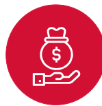
Lack of visibility on costs & accurate forecasting