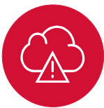
Complex cloud environments

When organizations first decided to migrate to the cloud, discussions probably focused on increasing their innovation, speed, and flexibility, many expected their IT costs would reduce too. The reality for many has been an ever-increasing number of workloads moving to the cloud, unchecked demand for cloud services that has resulted in spiraling costs. Many now realize they need to quickly regain control of their cloud spend and drive value from their cloud investments.