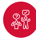
Increased effort due to inefficient operating model

FinOps is the answer. It is well documented that FinOps provides the actionable intelligence and organizational alignment that drives effective decision making and control over cloud usage and expenditure. For organizations seeking to mature in their use of cloud and optimize their cloud financial management and aspire to operational excellence, implementing a robust FinOps framework is key. However, many organizations simply don't know where to start.