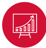
Unchecked usage & spiraling costs