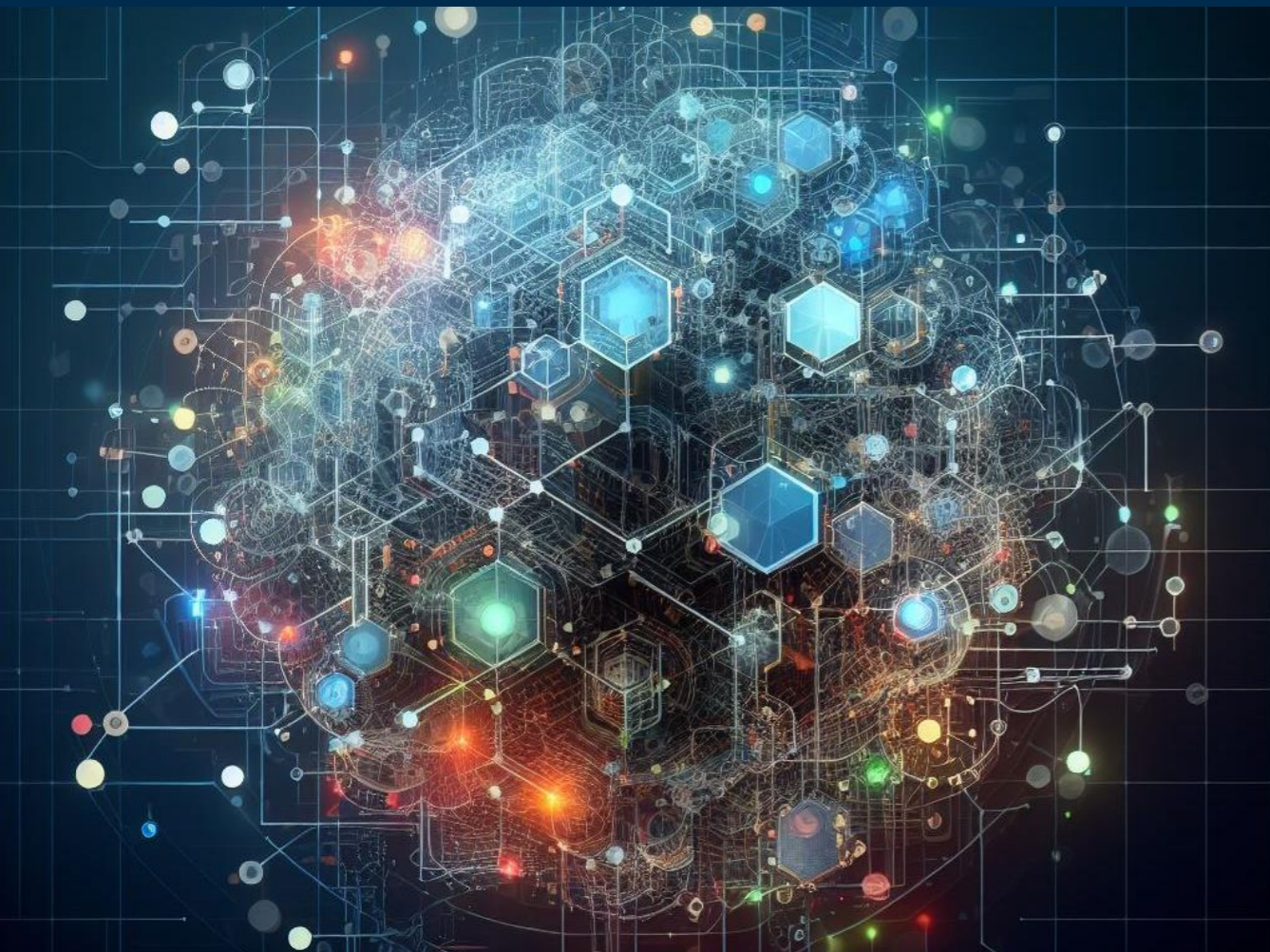
Image generated by Dall-E AI