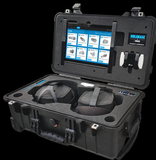
Medium Two TR