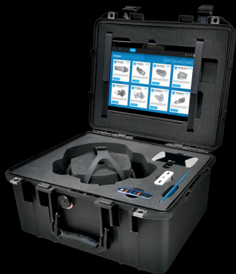
Small One TR