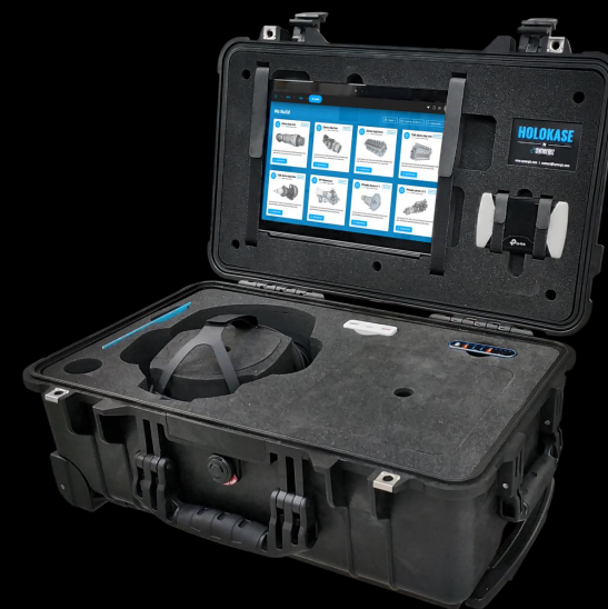
Customizable (Size & Content)