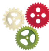
Multiple integration methods