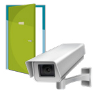
Door access & security