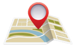
Point of sale