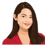
Person (customer) management

Full-feature capabilities are supported across all deployment options.