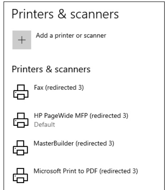
Figure 2. Redirected printers as they appear in a Windows 10 WVD session.