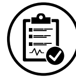
Review & Recommendations