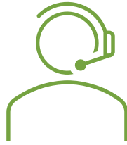
Managed Services and Support