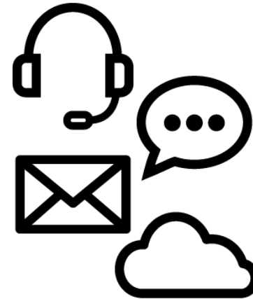
Information & Data (office data, mail, chat)