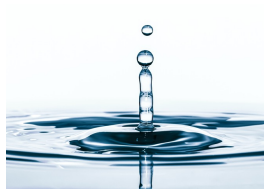
WATER CONSUMPTION REDUCTION