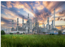
SCOPE 1 & 2 EMISSIONS MANAGEMENT