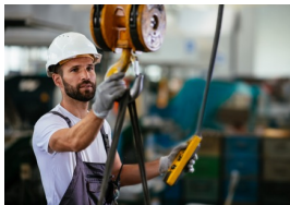
AUTOMATED SAFETY OBSERVATIONS