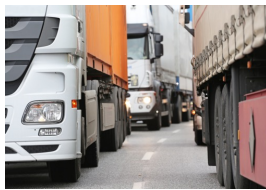
SCOPE 3 EMISSIONS CONSOLIDATION