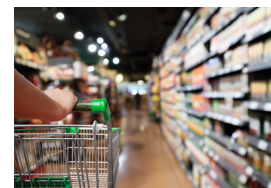
PREVENTING MODERN SLAVERY