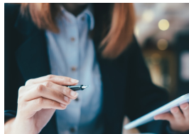
RISK MANAGEMENT EFFECTIVENESS